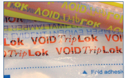
High visibility void feature.